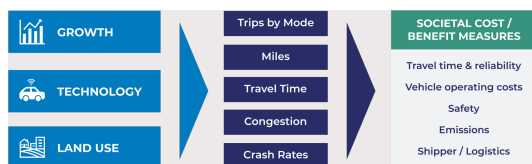
HRTPO Economic Analysis